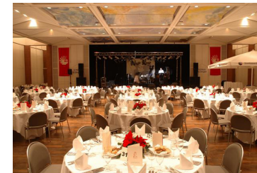
Ettlingen Castle Garden Hall