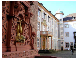
Baroque Castle in Ettlingen