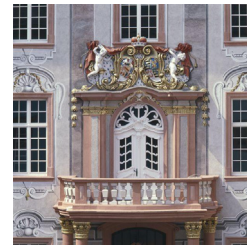
Balcony of Ettlingen Castle