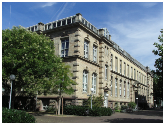
Venua Tulla Building

The organizer reserves the right to change the program in exceptional case.